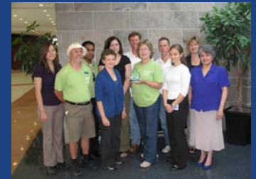
Made for Shade program - Durham Region Health Department