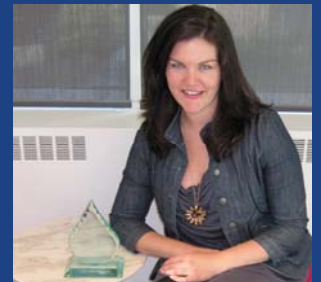
Glow Magazine - Jill Dunn for her article Good Day Sunshine