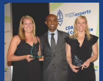
PsoriasisConnections.ca - Amgen Canada and Wyeth Pharmaceuticals

Residents' Grant Program Abbott Laboratories • Graceway Pharmaceuticals • Sanofi-aventis Canada